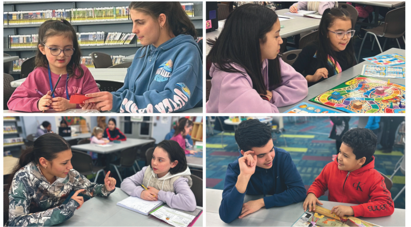
Teens help elementary school students during an After-school Success program.

The Foundation has received a generous $7,500 grant from TD Charitable Foundation to support After-school Success , an enrichment program for children in grades K-3rd. Under the direction of an experienced teacher, teen volunteers provide homework help and support reading and math skills. In addition, parents/caregivers will learn about online resources and circulating materials that can aid in their child's learning. Using these resources, families can continue to work together on skill building in the library and at home. Thank you, TD Charitable Foundation!