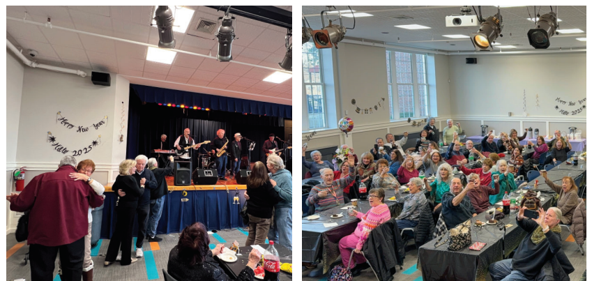
Dancers enjoying The Precisions.

Over 100 happy revelers joyfully welcomed 2025 at the Ring in the New Year celebration. Everyone enjoyed the lively music from The Precisions, with lots of dancing and merrymaking. Wishing all a happy and prosperous 2025!