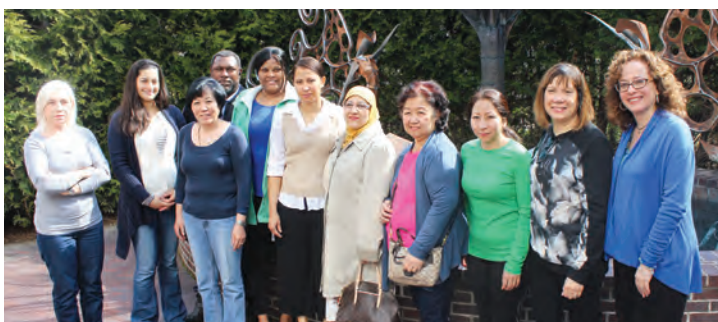
The library's Citizenship class students.